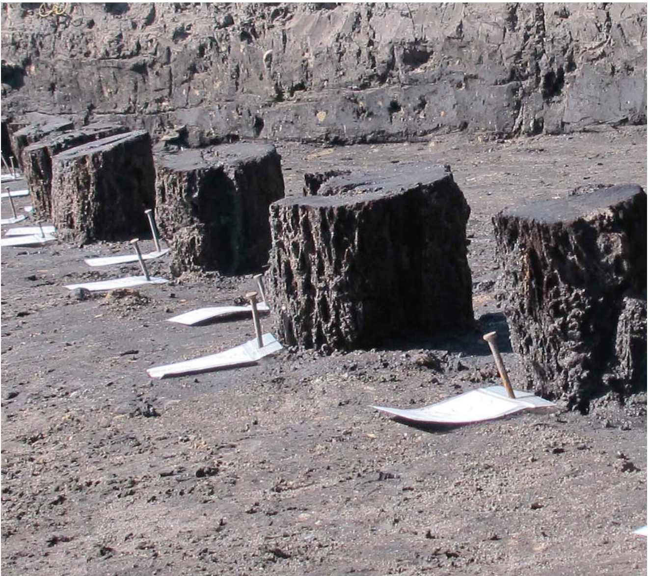
Row of posts from the prehistoric lakeside settlement Anarghiri IXb, Western Macedonia, Greece.