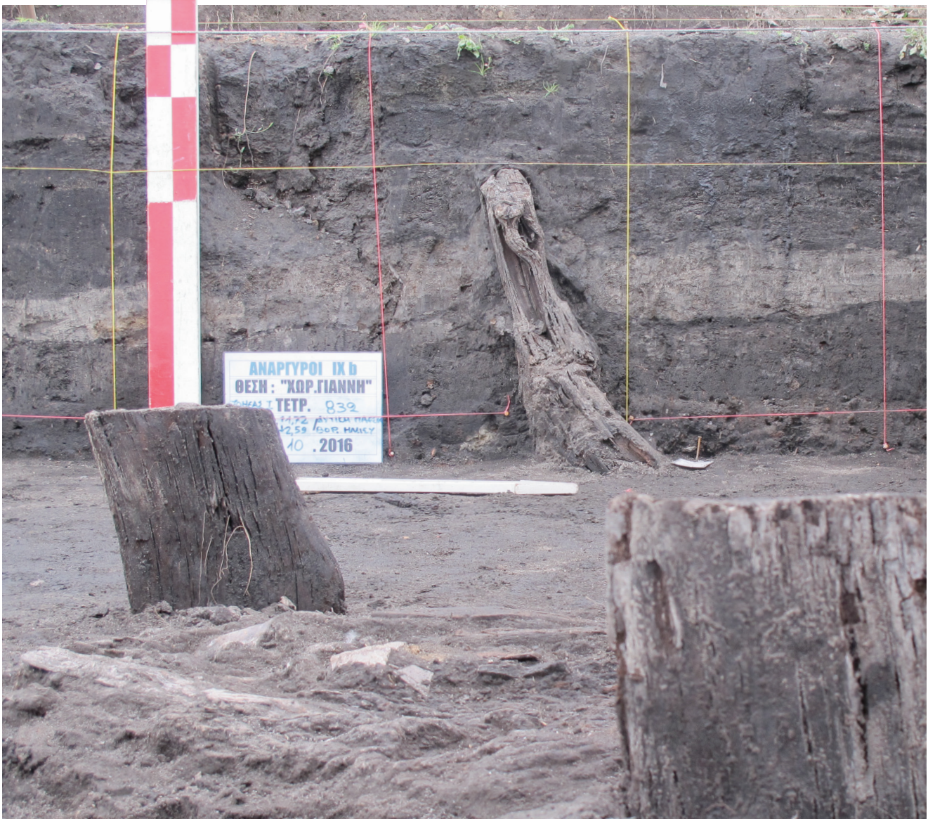
Posts and view of the stratigraphy of the prehistoric lakeside settlement Anarghiri IXb, Western Macedonia, Greece.